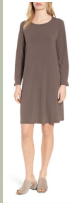
Run Around Dress