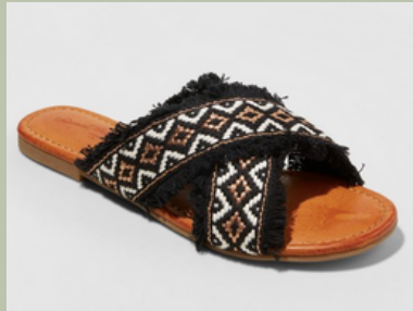
7 Summer Sandal