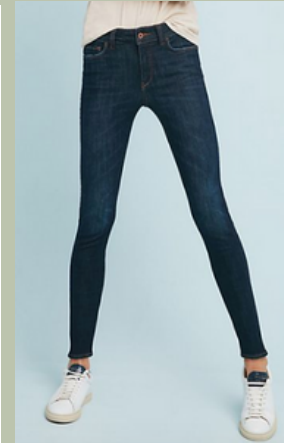
8 Booty Smile Denim