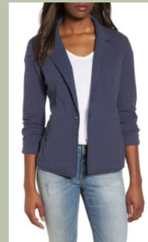
Light Weight Jacket