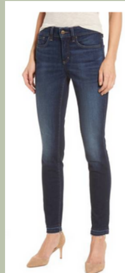
9 Great Trouser